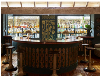
THE GREAT ROOM BAR