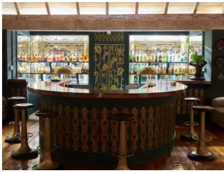
THE GREAT ROOM BAR