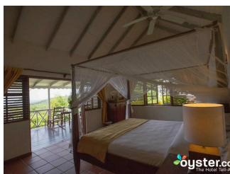
OCEAN VIEW ROOM – KING