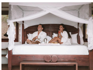
OCEAN VIEW COTTAGE