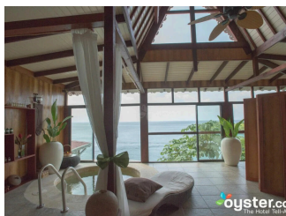
OCEAN VIEW ROOM - QUEEN