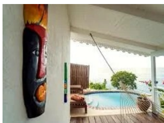
OCEAN VIEW COTTAGE WITH PRIVATE PLUNGE POOL