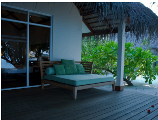
SUNSET BEACH VILLA

The beach villas indulge guests with a feeling of complete isolation in the middle of a private paradise while being surrounded by the very best amenities. All 45 Beach Villas on the island are individual bungalows that are spread out across the Vakaru island and are surrounded by lush tropical flora and fauna. All these Maldivian style beach villas are topped off with its very own secluded private beach. Vakaru beach villas are perfect for a private getaway. The surrounding lagoon and direct beach access makes it the perfect way to experience everything the Maldives Islands have to offer.