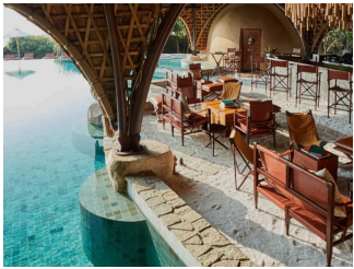
TEN TUSKERS BAR