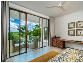
DELUXE KING SUITE