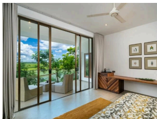
DELUXE KING SUITE