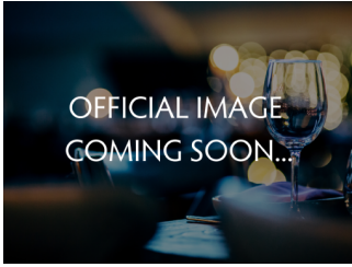
LOR DISAB - PIROGUE BAR